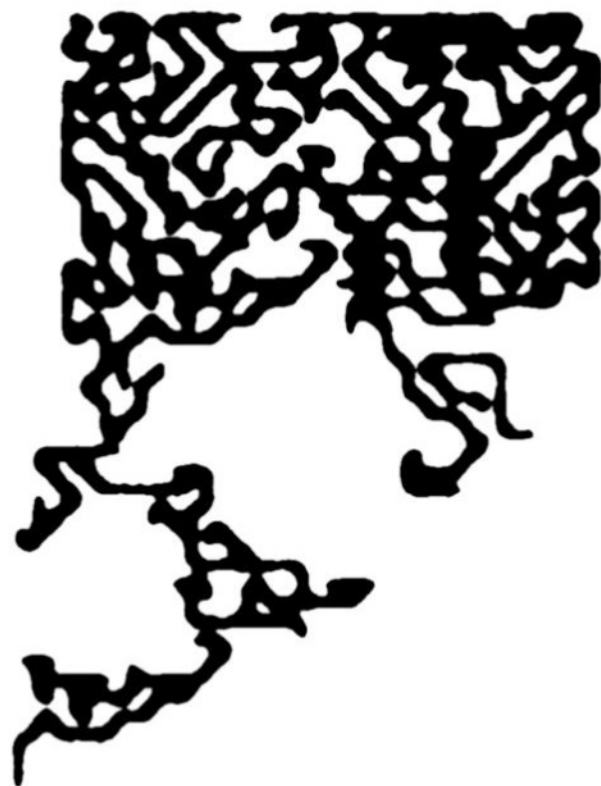
"render taj maze" Billy Mavreas 5